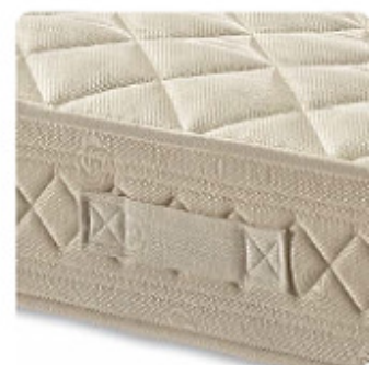
Side band complete with fabric handles for the mattress positioning on the bed frame