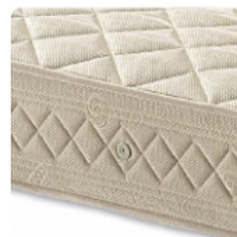
Embroidered side band with the application of aerators for complete breathability of the mattress.