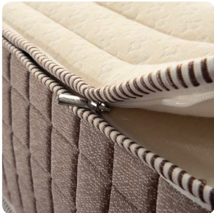
Under-edge perimeter zip for complete removing of linings.