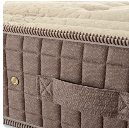
Elaborate side band complete with fabric handles for the mattress positioning on the bed frame and aerators for breathability.