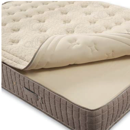
Fully divisible lining for perfect hygiene.