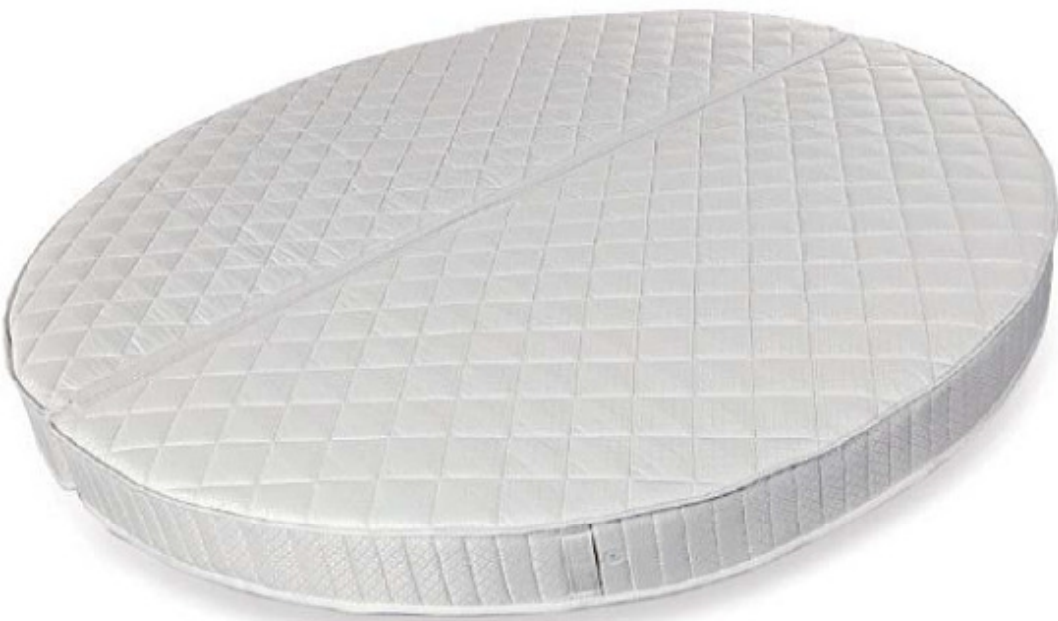
Detail of the union hinge in the version with two half-moons.