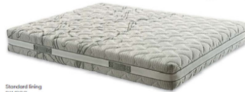
Standard lining BAMBOO

Fully divisible lining for perfect hygiene.