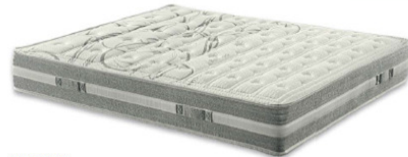
Standard lining BAMBOO ELITE

Completely Removable with zip ABOVE & BELOW