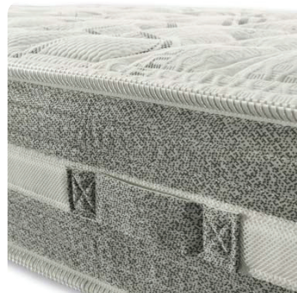
Elaborate side band complete with 3D breathable insert and fabric handles for the mattress positioning on the bed frame.