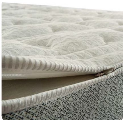
Under-edge perimeter zip for complete removing of linings.