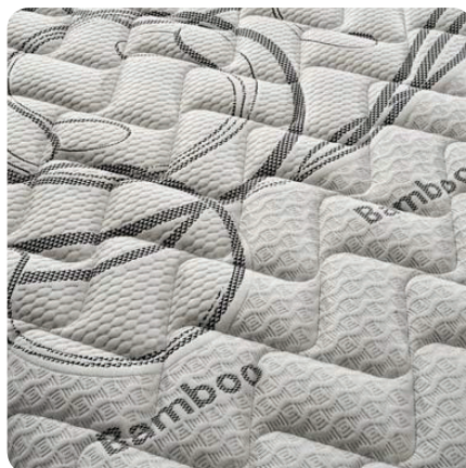
BAMBOO lining made of bamboo fabric combined with fibre and polybamboo padding.