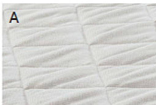
A HYPOALLERGENIC lining. Washable at 60°.