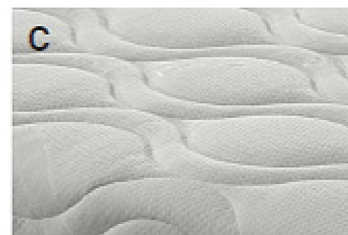
C EASY lining. Washable at 60°.