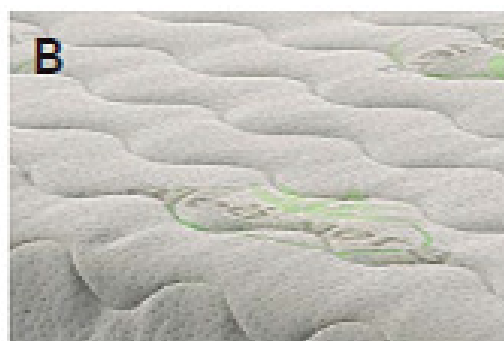
B ALOE VERA lining. Washable at 60°.